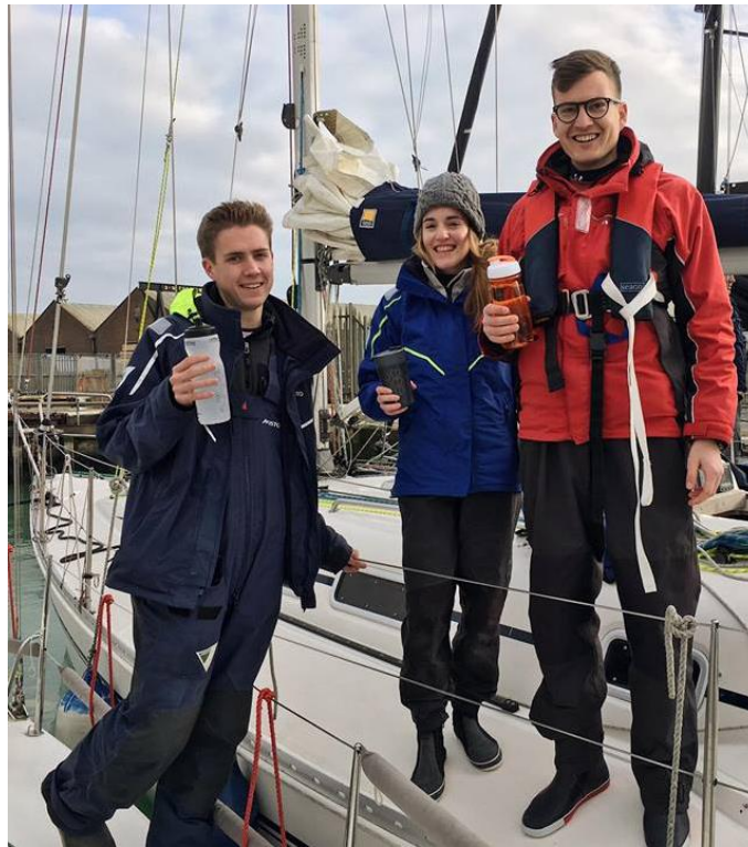
Sussex make sure their sailors have re-usable sports bottles during sessions so reduce waste with single-use plastic bottles