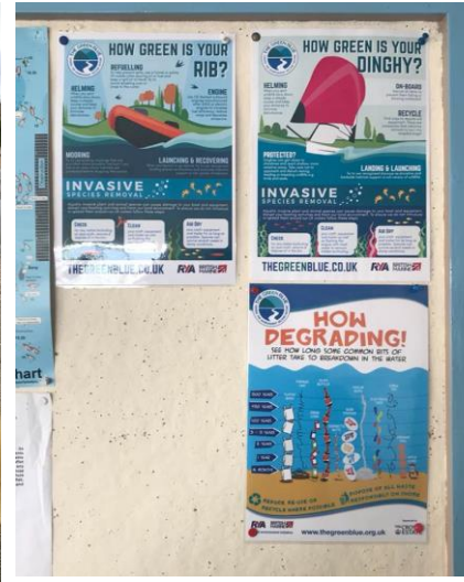
Swansea puts the words about at Tata Steel SC, Margam