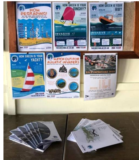
University of Sussex Sailing Club attract interest at host's Sussex Yacht Club with their display of Green Blue posters and leaflets

The Challenge involves university sailing clubs competing to undertake as many sustainable actions as they can throughout the academic year. By undertaking these positive actions, they will have the opportunity to demonstrate to the rest of the boating community how achievable and rewarding sustainable boating can be.