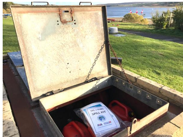
Newcastle USYVC has a spill kit ready in their fuel store

Sustainable actions include: ensuring sailing venues have a Spill Kit available to clean up any accidental spills when boaters are handling oil and fuel, ensuring members use re-usable sports bottles during training sessions and events to reduce waste and single use plastic bottles, and making sure boats, trailers and equipment follow the Check Clean Dry approach to minimise the risk of spreading invasive non-native species around UK waters.