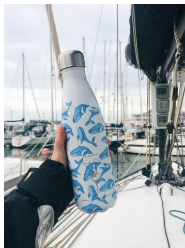
Another, pretty, but fishy, Sussex reusable waterbottle