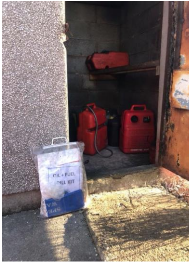
Swansea's spill kit in evidence at the fuel store