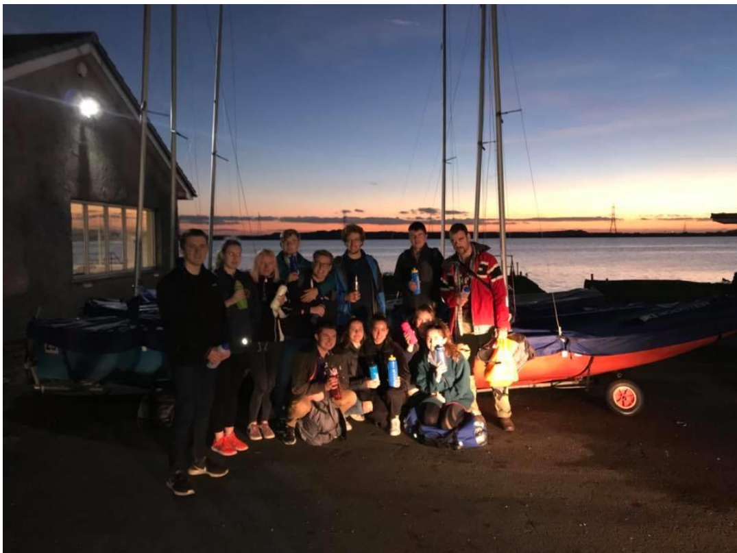
Swansea University Sailing Club have their reusable bottles, but we hope they enjoyed their sunset too

BUSA has a Development section at https://busa.co.uk/development/busa-and-development , which includes a dedicated page for the Challenge: https://busa.co.uk/development/university-sustainability-challenge