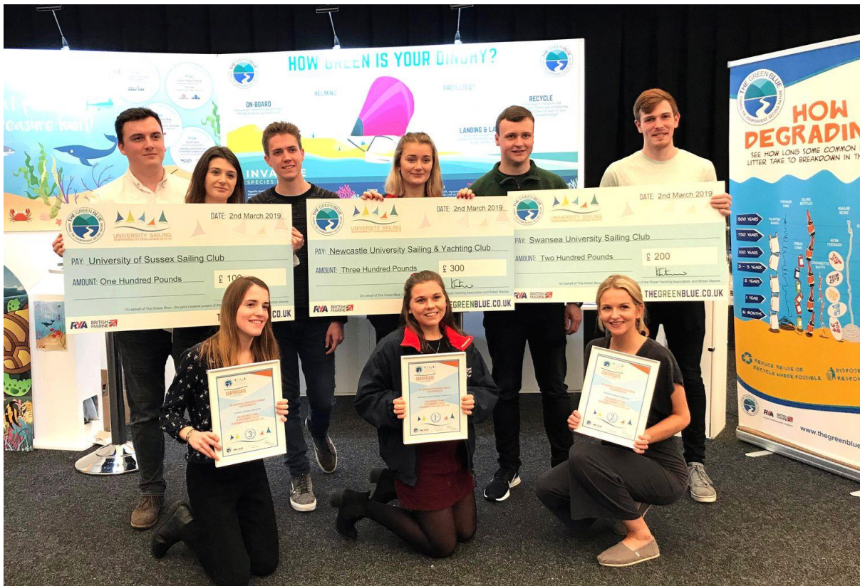
Sussex (3 rd Place), Newcastle (1 st Place) and Swansea (2 nd Place), winners with their cheques and certificates (Dundee and East Anglia also won joint 3 rd place)