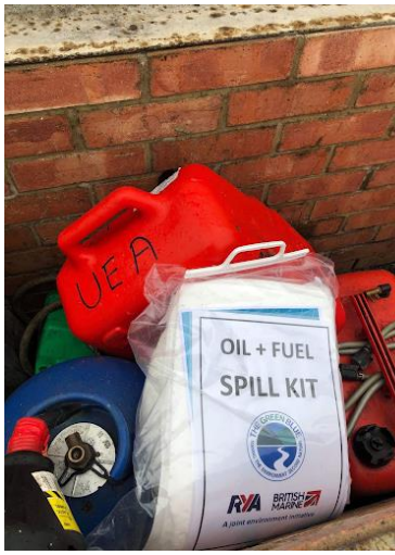
UEA Sailing & Powerboat Club are well-prepared just in case to ensure no pollution on their Broad