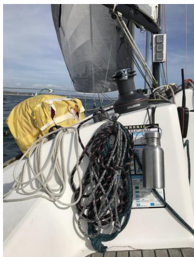
Sussex securely stow a reusable water bottle

"At NUSYC, we have flag officer roles alongside the main committee roles, one of which is Sustainability Officer. I personally have really enjoyed being the club's Sustainability Officer, as it's been really rewarding and being in my final year has been great for talking about at job interviews".