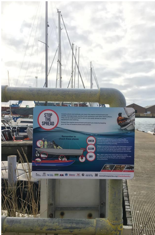
University of Sussex Sailing Club tak their publicity campaign into the their host's yacht haven at Sussex Yacht Club