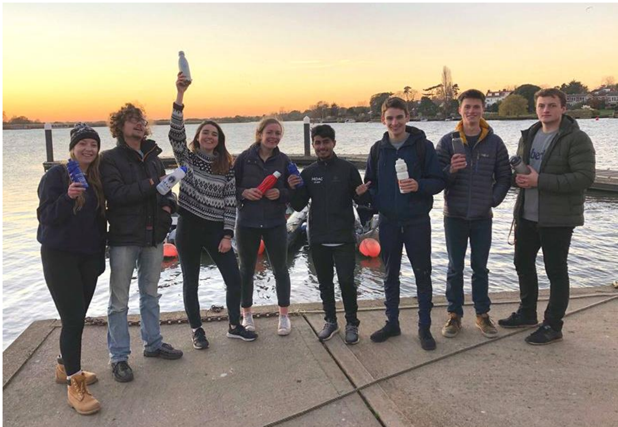
University of East Anglia Sailing and Powerboating Club have their reusable bottles to hand as the sun sets on another dream day on Waveney & Oulton Broad

“From my short time acting as the Sustainability Officer, I found it to be not only an enjoyable experience but extremely gratifying. What is evident from the sailing community was the high level of effort everyone was willing and strived to put in to make sailing more sustainable. From this, it was clear just how much people appreciate our inland aquatic environment!