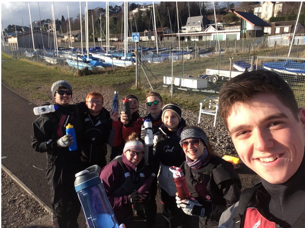
Dundee University Sailing Club end the day at the Royal Tay YC with a friendly demonstration of their reusable bottles

As part of the Challenge, a set number of sustainable actions had to be achieved and evidenced by competing university sailing clubs. These included performing an environmental audit of their sailing venue to identify and improve areas that can be made more sustainable, ensuring all their members use reusable water bottles as opposed to one-use plastic bottles, installing an oil/fuel spill kit at their sailing venue to clean up accidental spills when refueling, and demonstrating ‘check, clean and dry’ best practice to minimise the spread of alien species around UK waters.