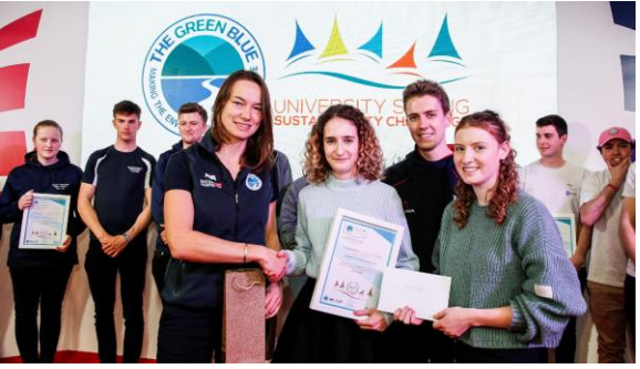
Find out who took home last year's prizes at the 2020 RYA Dinghy Show here.