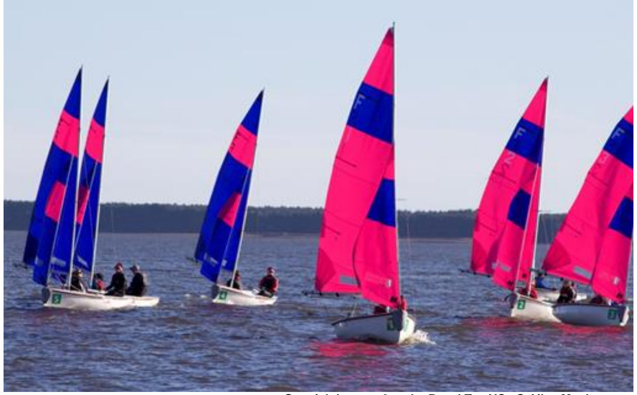
Scottish League 3 at the Royal Tay YC