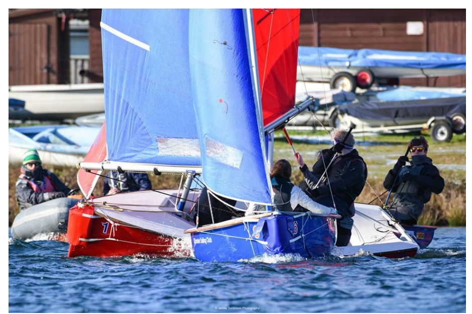
South-Central Qualifier

"However, the Area Rep [Nicole] had been victimized by the snow with the final boat in tow in Basingstoke on Friday night. With a blustery start to the day, racing continued until sunset, in the hopes of getting in as much racing as possible due to the low winds forecast for Sunday. 62 races were completed, just short of the 70 the PRO wanted, after a brief off the water hearing, leading to a slight delay getting the races running back to back.