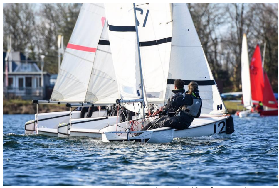
South-Central Qualifier

"The afternoon then prompted some great racing and brilliant conditions. Racing finished at 15:20 with 100 races in the bag. The weekend turned out to be a great success".