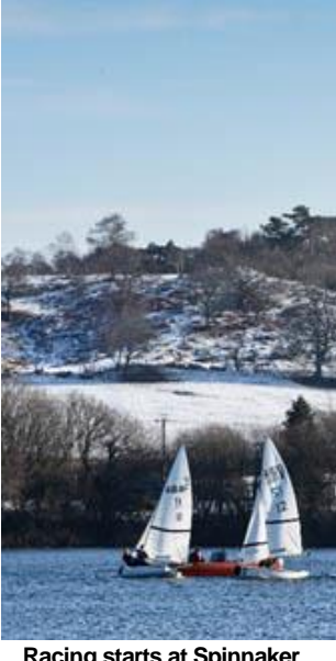
Racing starts at Spinnaker