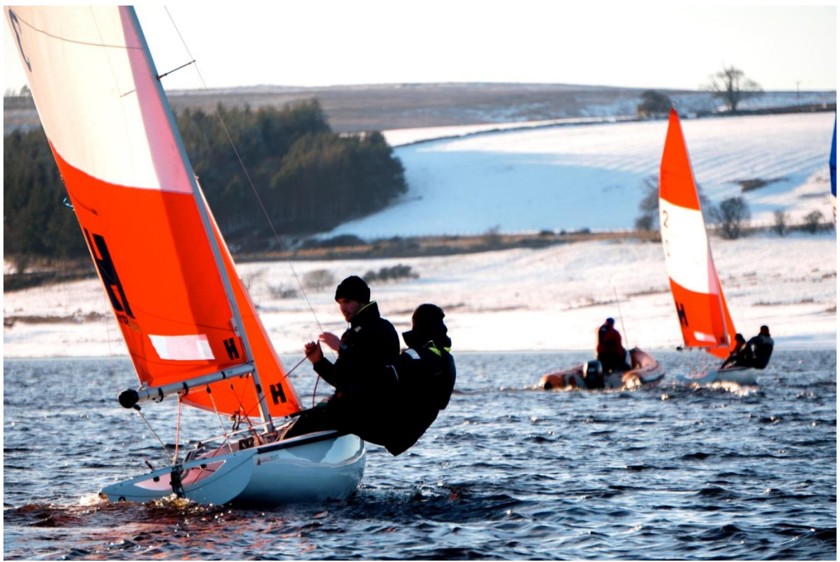
Derwent Water at its best for the Northern Qualifier

George Haynes, Northern Area Coordinator, of Newcastle wrote: "Racing got underway early on Saturday morning at a very snowy Derwent Reservoir. The wind remained consistent for the whole day, and with few incidents to hold up racing, PRO Sean Clarkson was able to run 72 races. Overnight, the results were very close, and a few races into day 2, there was a 6-way tie for first place. It was all still to play for!