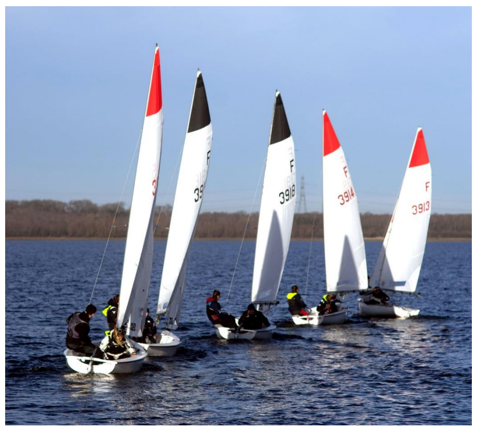
Loughborough Purple vs Kent Black at the Midlands Qualifier

"Due to the excellent conditions of the day, all the races could be completed. In the fading light, it was decided to have a race between the Race Committee and Edinburgh Blue. Who would be better, the current winners of the Scottish qualifiers or the team made up of (some) ex-Edinburgh sailors and with over ten years' experience in team racing? After a very close fought race with the sudden and unexpected 1st going to the student team, it was Edinburgh Blue who took the win".