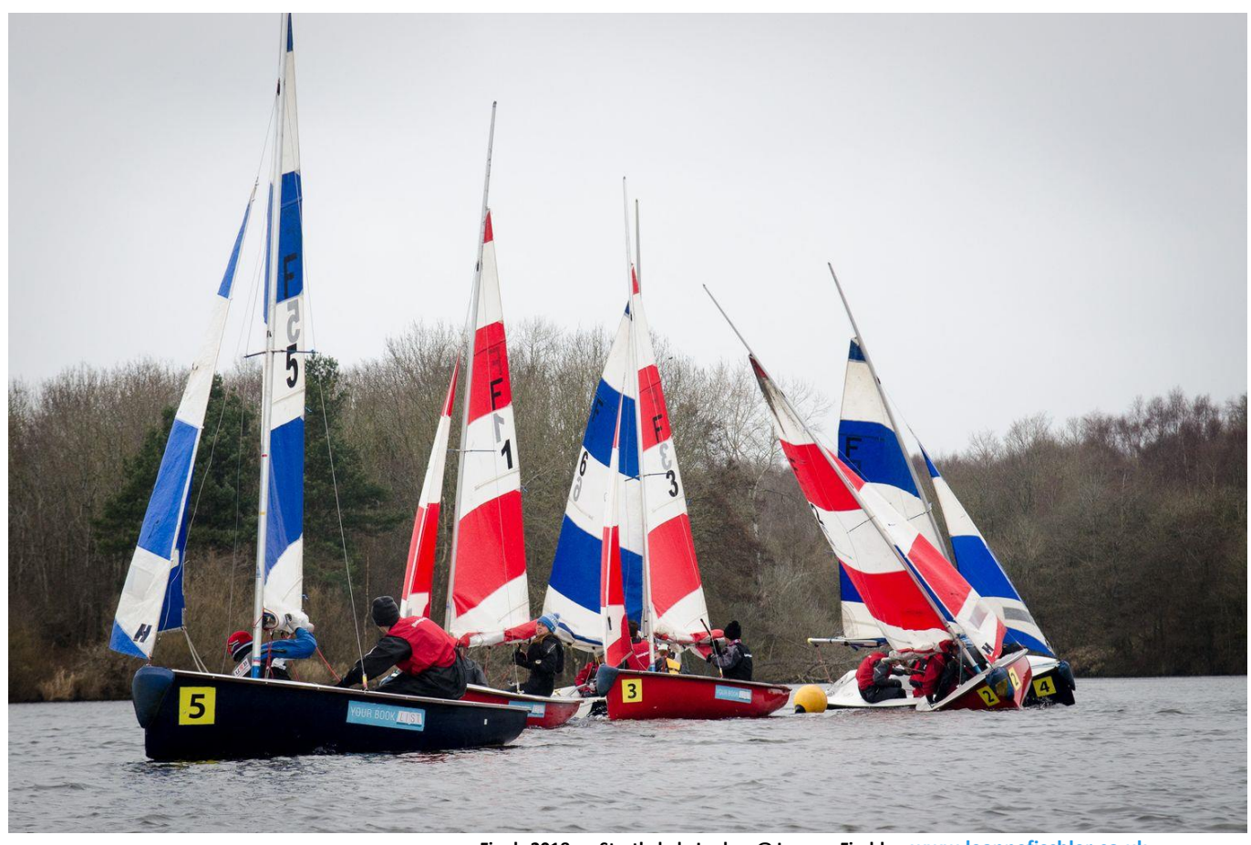
Finals 2018 on Strathclyde Loch