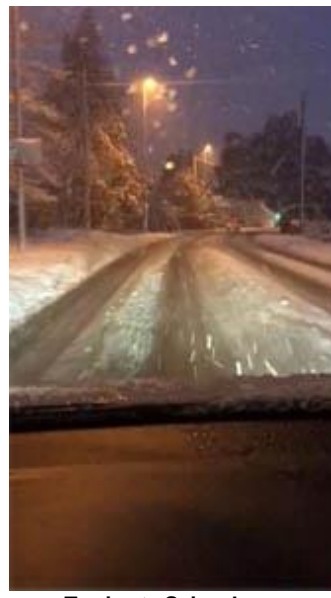
Towing to Spinnaker

The Area Coordinator at Spinnaker just made it in time for the start of racing, with a last batch of boats in tow from Winchester, where the snow had moved through from the south-west on Friday night.