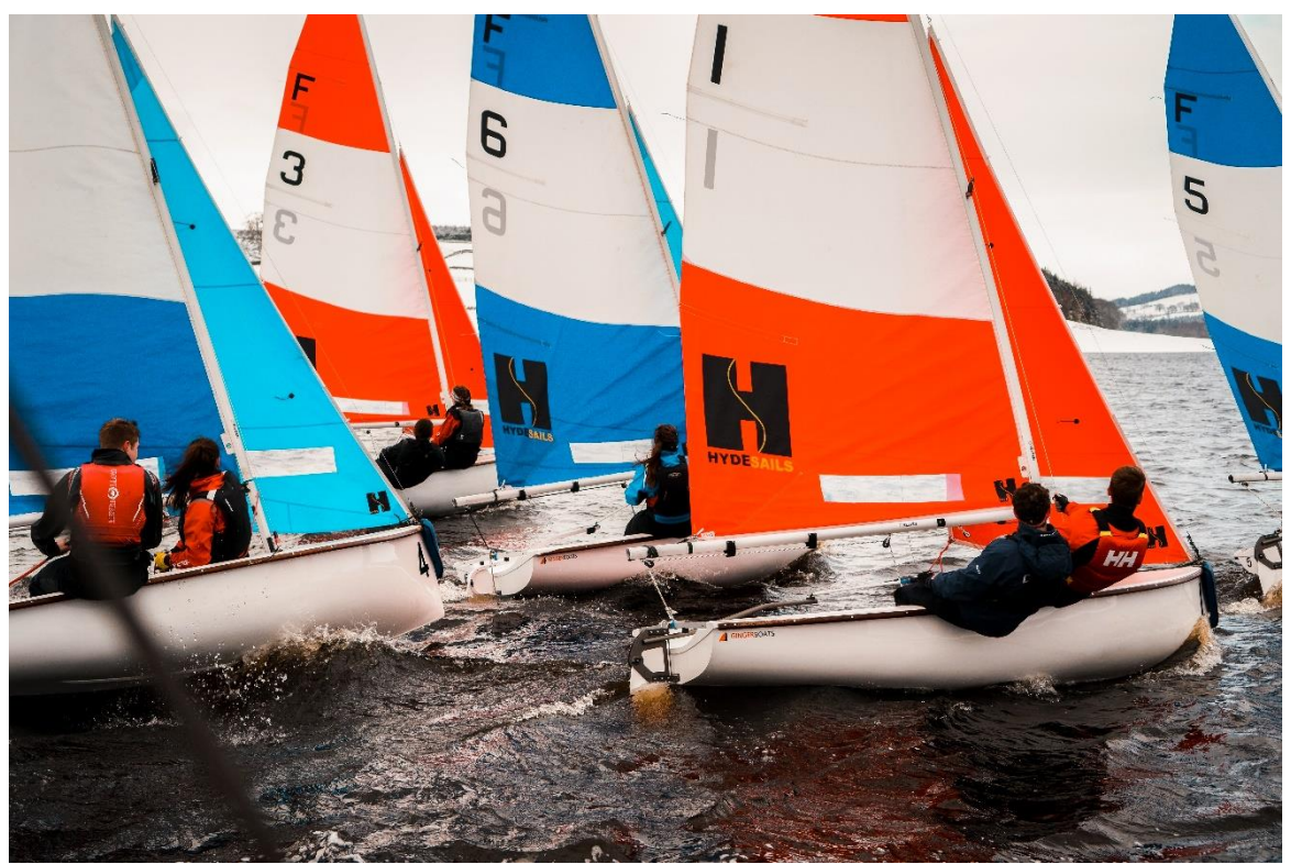
Close action at the Northern Qualifier

George Haynes, Northern Area Coordinator, of Newcastle wrote: "Racing got underway early on Saturday morning at a very snowy Derwent Reservoir. The wind remained consistent for the whole day, and with few incidents to hold up racing, PRO Sean Clarkson was able to run 72 races. Overnight, the results were very close, and a few races into day 2, there was a 6-way tie for first place. It was all still to play for!