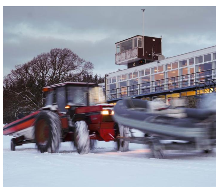
Early start for Newcastle volunteers launching at Derwent Water