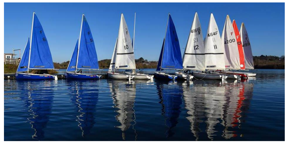
Ready for action at South-Central Qualifier

"The afternoon then prompted some great racing and brilliant conditions. Racing finished at 15:20 with 100 races in the bag. The weekend turned out to be a great success".