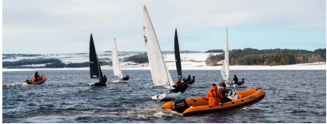
Racing on Derwent Water for the Northern Qualifier

Karen Thomas, Midlands Area Organiser, of Cambridge wrote: "The forecast for the weekend looked promising, with the snow subsiding and more wind forecast on the Saturday. Upon arrival PRO Tim Palmer made the decision to rig all flights with cut down sails and racing got underway. As the wind started to creep up, RIB changeovers became more interesting and two universities battled it out for the top 4 spots (Cambridge & Birmingham). Racing was paused for the day at race 68 with everyone looking forward to the promise of lighter and more stable winds the following day.