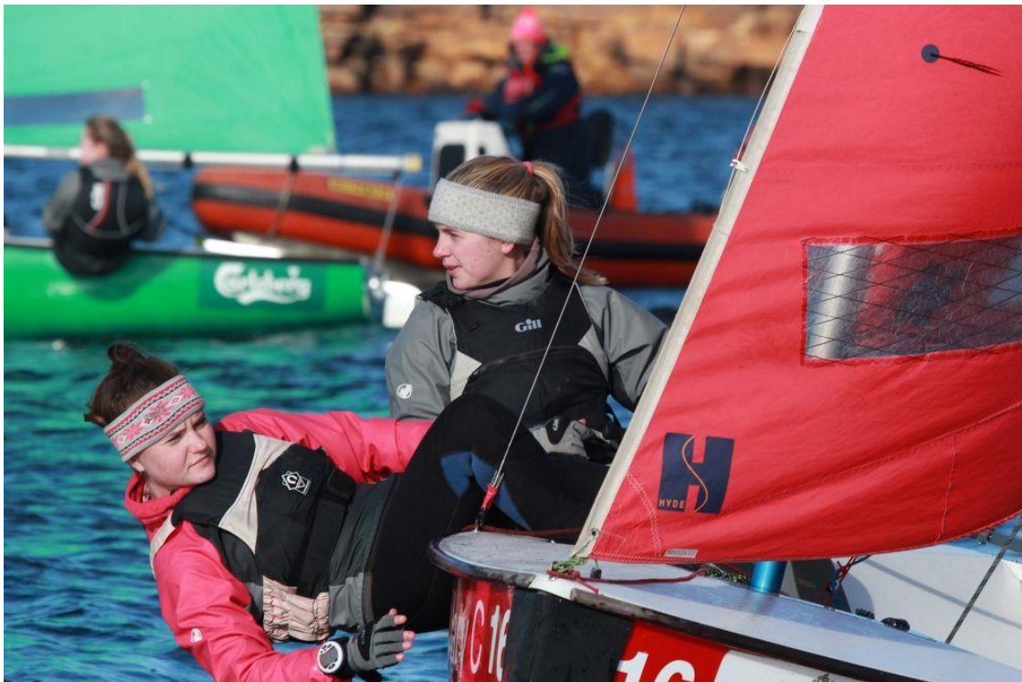
Northern Qualifiers at Pennine SC

To sum up, the Scottish qualifiers were held over a series of three weekends and made use of leagues, so the 21 teams entered were, perhaps, not under as much stress as everyone else over the final weekend. They only managed 49 races on Saturday, due to lack of wind, but It seemed that it may have been the best day of racing in their entire, just showing what strange weather we are getting. 1st were Glasgow Pink (9 wins out of 10 races), 2nd Strathclyde Blue (8 wins), 3rd Edinburgh Blue (7 wins) and 4th Glasgow Blue (3 wins).