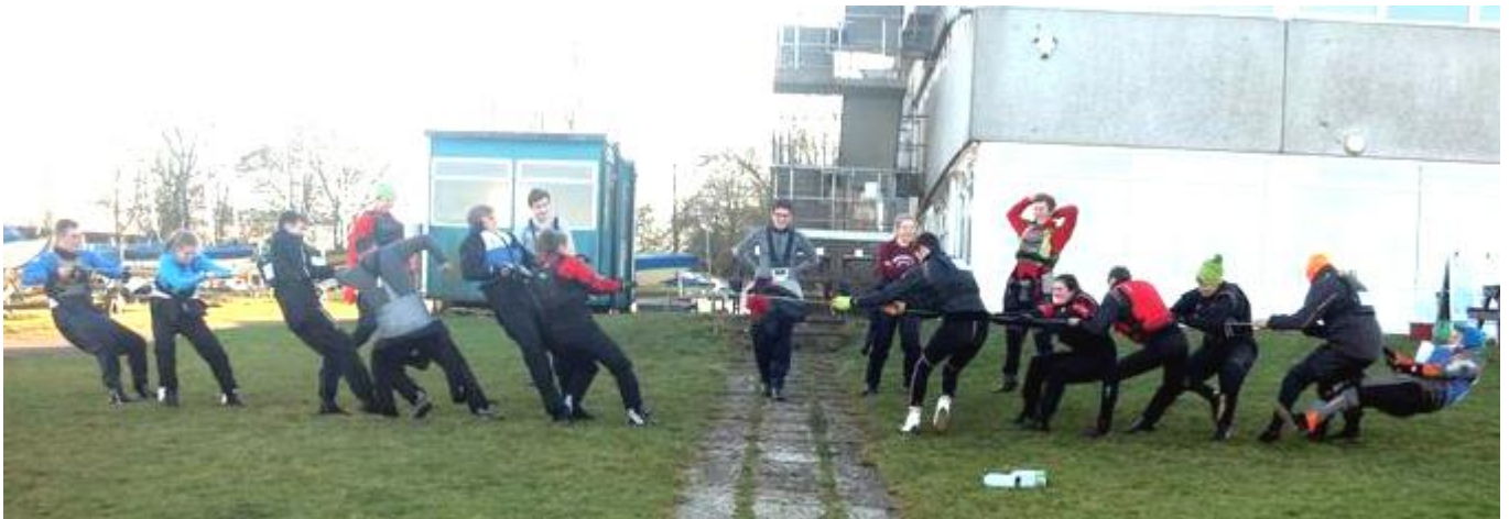
A surfeit of energy at the Midlands Qualifier at Grafham Water SC

The Northern was second largest Qualifier, with 20 teams entered. Despite the weather, they managed 100 races and finished with Newcastle Blue, Manchester Purple and Leeds Green all on 9 race wins, but finishing in that order. Liverpool Red and Durham Purple are shown as both on 8 wins, but the tie break went to Liverpool, so was listed in fourth place