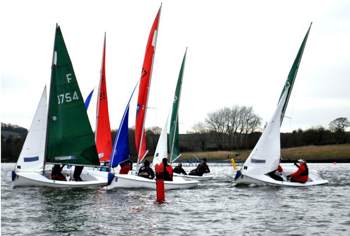
Western Qualifier at Chew Valley SC