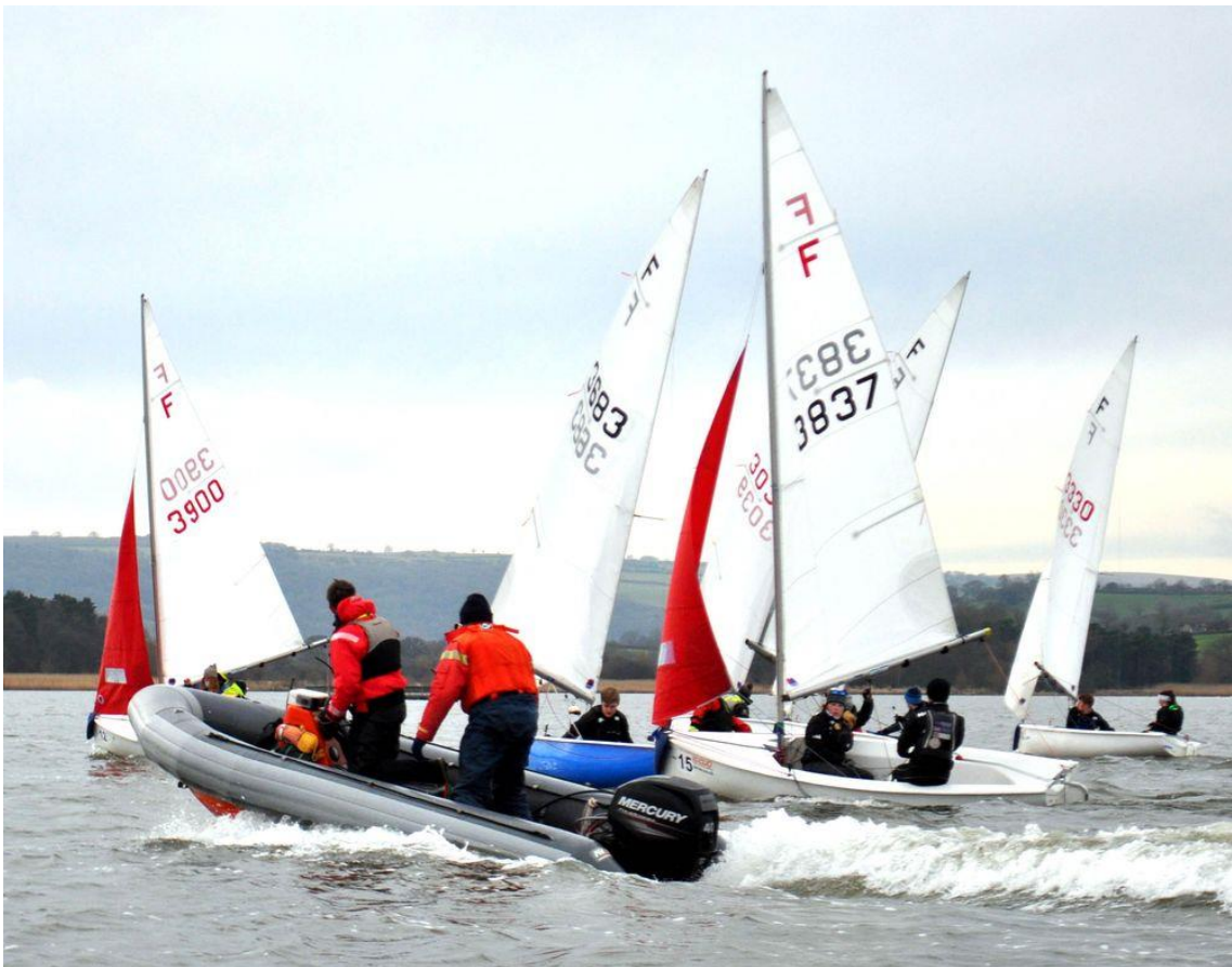
Western Qualifier at Chew Valley SC