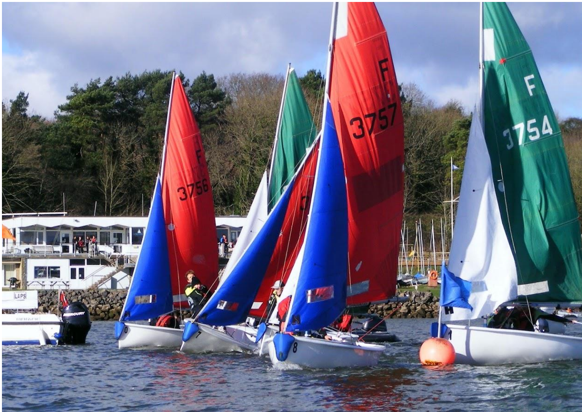
Race underway at Western Qualifier on Chew Valley Lake