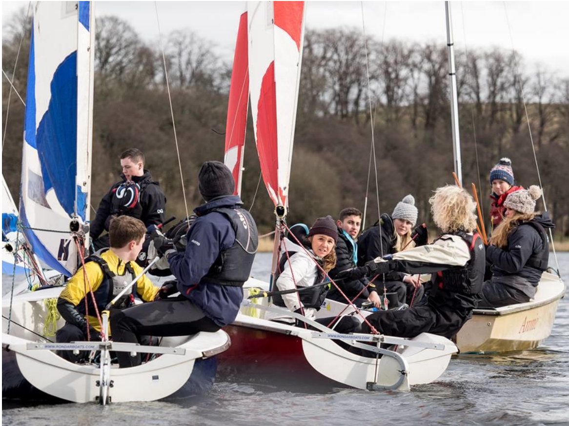
Close sailing in light winds at the Playoffs on Bardowie Loch

Summing up, the South-Central Qualifier only managed 39 races on the Saturday, but then put the pedal to the metal and completed the rest of their 136 races on Sunday. This looks to have been very closely fought, with a couple of tie breaks being used at the top. Southampton Purple came out on top, London White and Southampton Green finished 2nd and 3rd (both on 13 wins), fourth and fifth, on 12 wins, were Oxford Black and Southampton White.