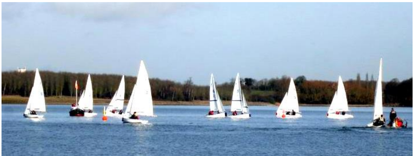
Midlands Qualifier

In summary, the Midland Qualifier at Grafham Water, hosted by Cambridge, suffered, not just from a lack of wind, but a lack of visibility due to fog. Nevertheless, they completed 111 races over the weekend and the leaders were Cambridge Blue, Black and Purple, with Warwick Black in fourth place.