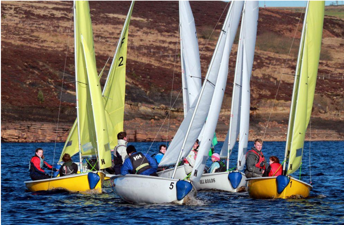
Northern Qualifiers at Pennine SC

With no wind to start with (AP looking distinctly droopy), light winds eventually enabled some sailing on the Sunday, Sean Clarkson reported: "Stop and go racing, trying to get through the races amidst changing wind speed and direction....one race at a time!!" At the end of the day at the Northern Qualifier, 100 races had been completed, amidst fading light and dying wind!"