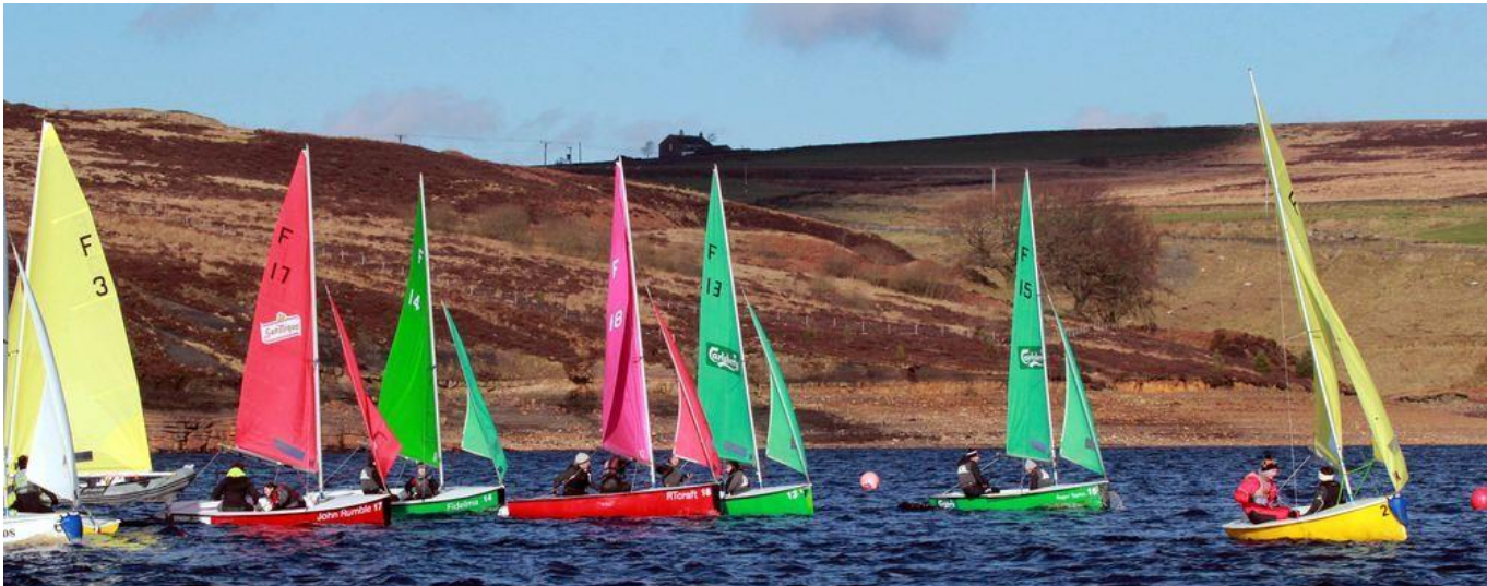
Northern Qualifiers at Pennine SC