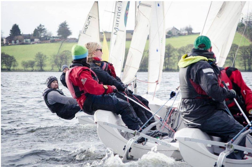
Scottish League Weekend 3