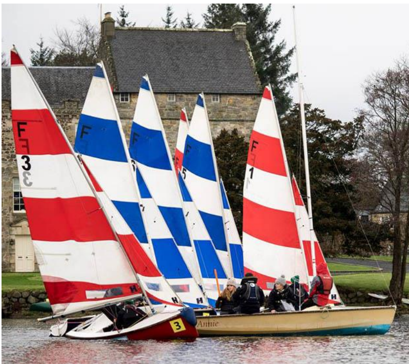
A start at the Playoffs 2017