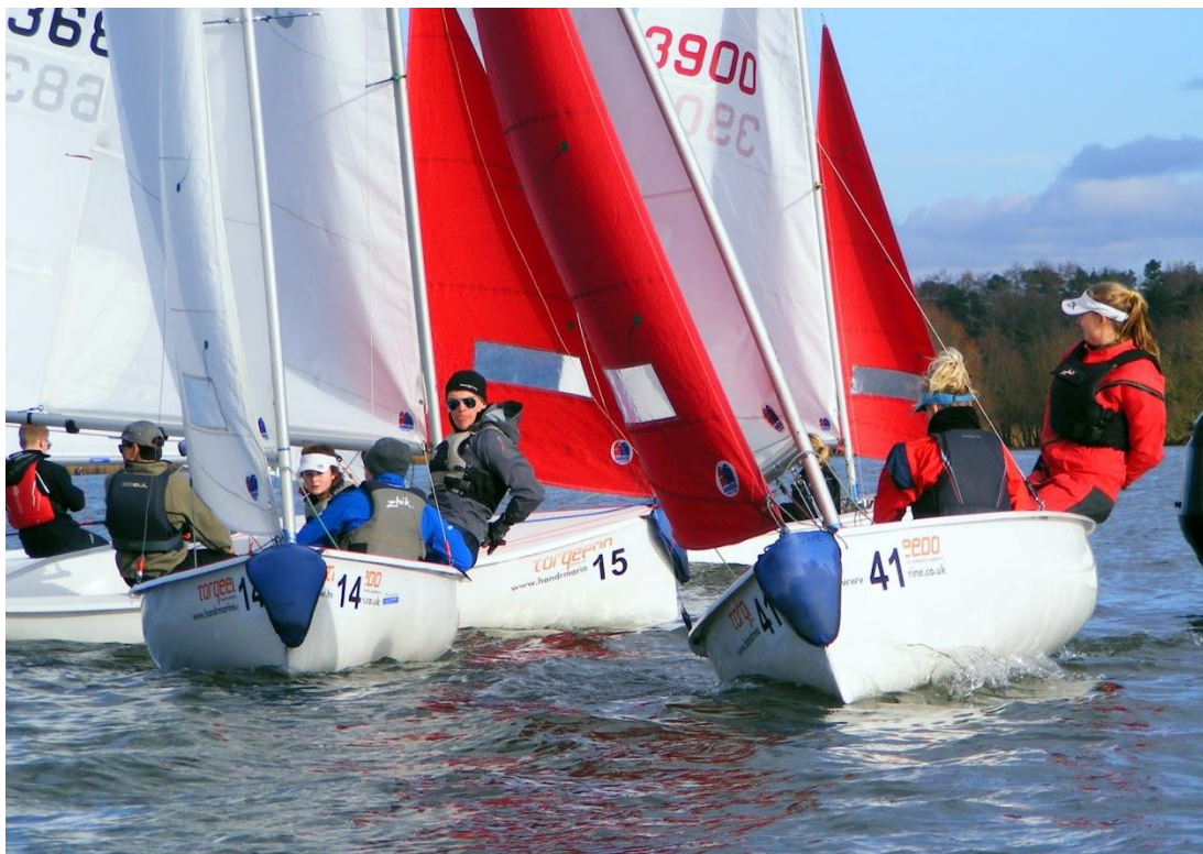
Western Qualifier at Chew Valley SC

“On Sunday, we pulled off a further miracle, completing the schedule, with the umpires not stopping for tea breaks! - collecting their drinks on the way back to the start line!”