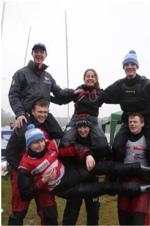
Cambridge Black, psychological capsizers, who voted themselves the funniest team.

At 11.a.m. no capsizes had happened yet but Cambridge black had “mentally turtled”. They're among the teams planning on putting into action a 'bounce back' strategy, described by Cardiff as “You do really horrendously...until no one expects anything, then you surprise them all and bounce back.”