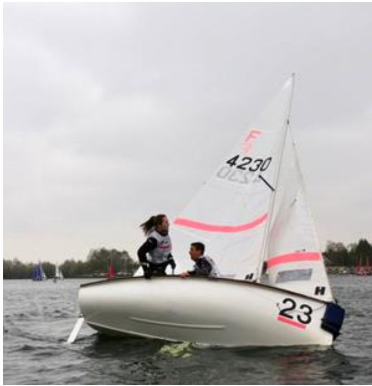
Manchester in action