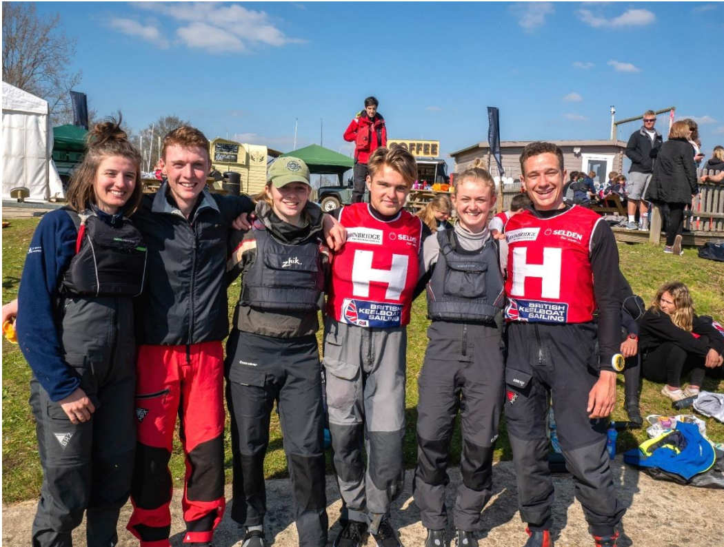
Exeter Blue