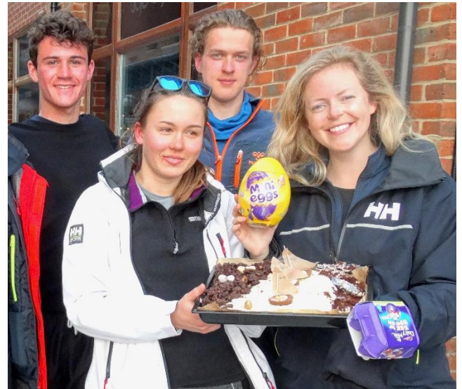
Oxford White's Head bakers