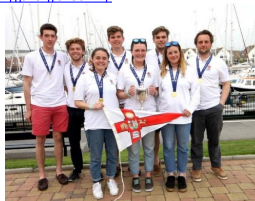
Bristol, Trophy winners