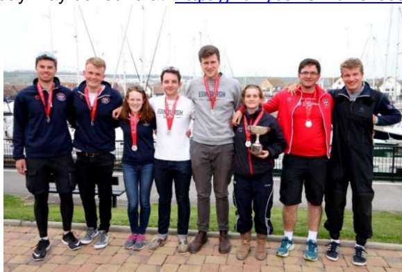
Edinburgh, with their silver medals