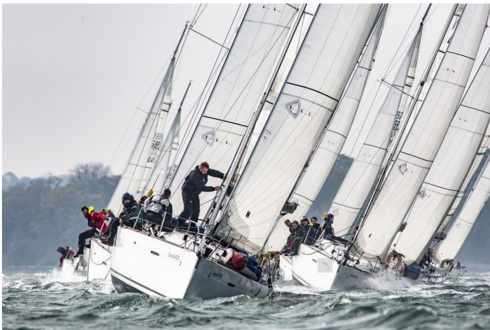
Southampton Red and Exeter in the forefront