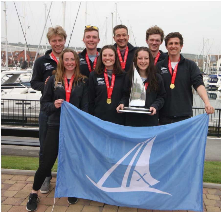
2019 Champions - Exeter

At the prize giving, the Sunsail Trophy and BUCS medals were awarded to Exeter, together with Championship medals for Edinburgh and Swansea. The John Derbyshire Trophy was awarded to Bristol, together with Trophy medals to teams Cambridge and Southampton Red.