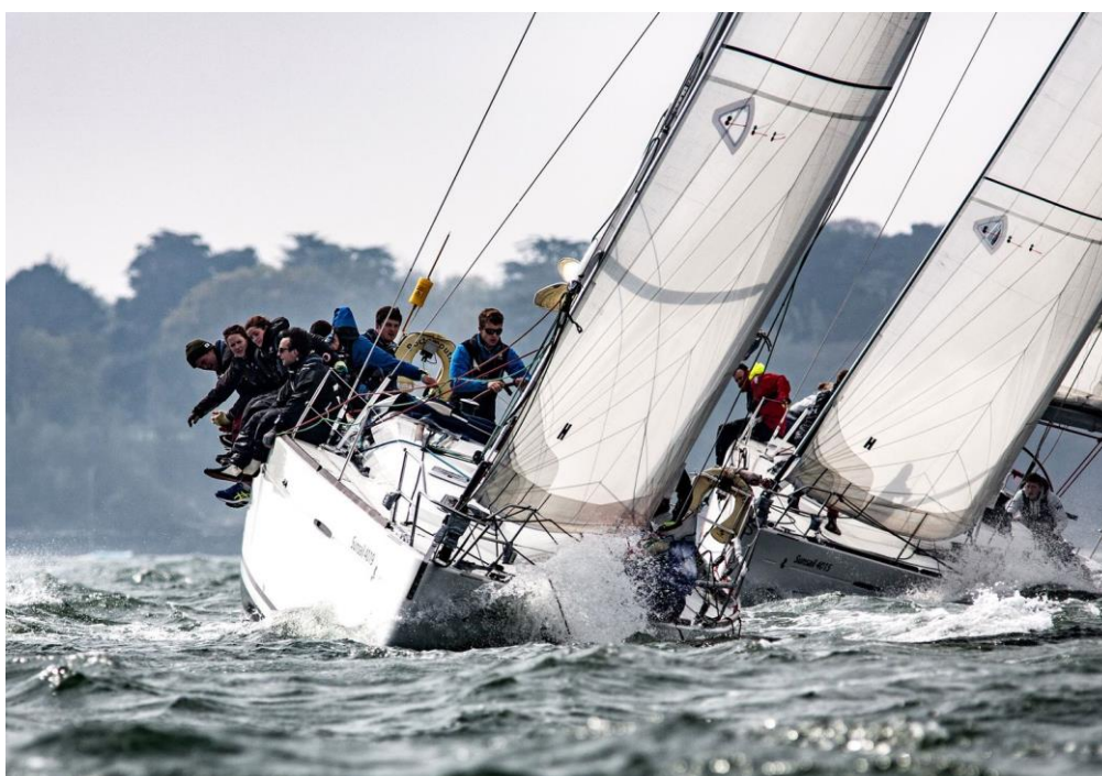
Edinburgh and Swansea