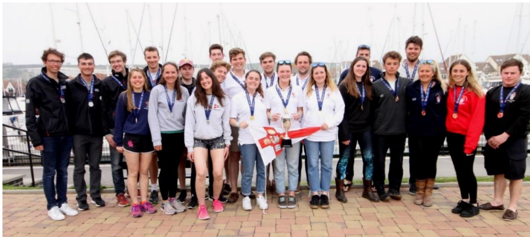
The medallists in the Trophy Fleet: Cambridge, Bristol and Southampton Red