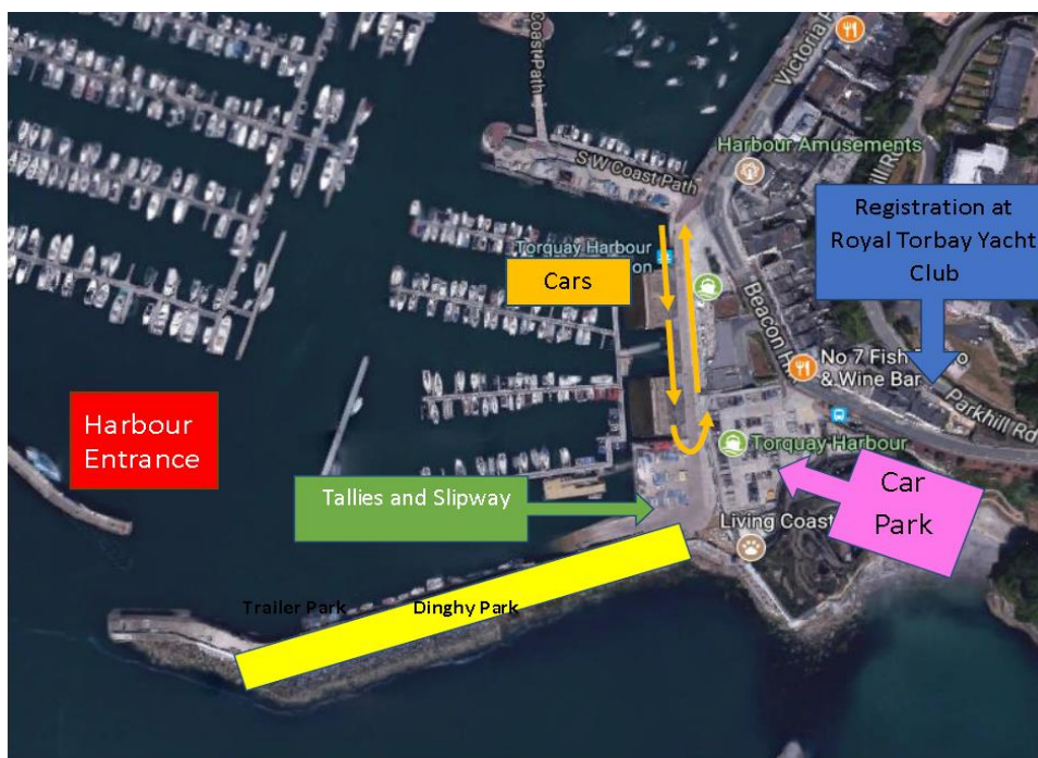
FIGURE 3. PROPOSED ONSHORE AREA

There is parking on Haldon Pier for 90+ dinghies. Road trailers will be stored on Haldon Pier (if space permits) or in the secure area nearby. There is a public car park (payment using Ringo App) immediately above the harbour, and public toilets on the harbourside. RTYC can contact the car park operator to gain exclusive rights of the top floor, if required. There is a large slipway with safe launching into Torquay Harbour.