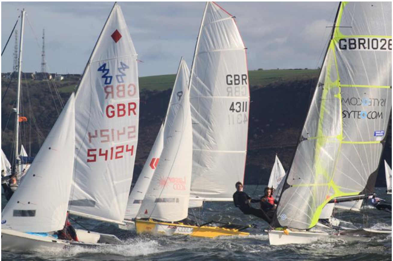
BUCS Fleet Championships 2011

The competition can be fierce, but there is a great spirit and every effort is given to support as wide participation as possible. In addition to individual Fleet titles, there is also great competition for teams in the points-based league table, with an overall University Team title, BUCS Medals and the all-important BUCS (financial) points to carry back in both the women's and men's categories.