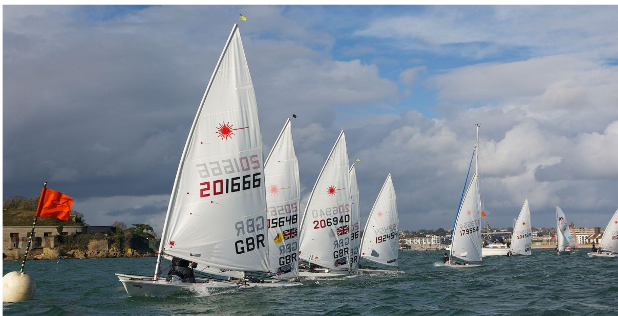
Very close competition in the Laser Fleet at the 2014 Championships

This is the first national sailing event of the academic year. It draws over 100 competitors from around the U.K., including many new students having their first taste of university sailing at this event. But it also attracts some skilled, high performance sailors, often recently in youth squads and some even starting Olympic campaigns, alongside sailors who sail in a variety of classes and at club level or have developed their sailing through training afforded by university sailing clubs. Usually with four fleets – Laser, Firefly, Slow and Fast Handicap – sailors bring their own boats and fleets of university Fireflies; various opportunities to charter are also provided.