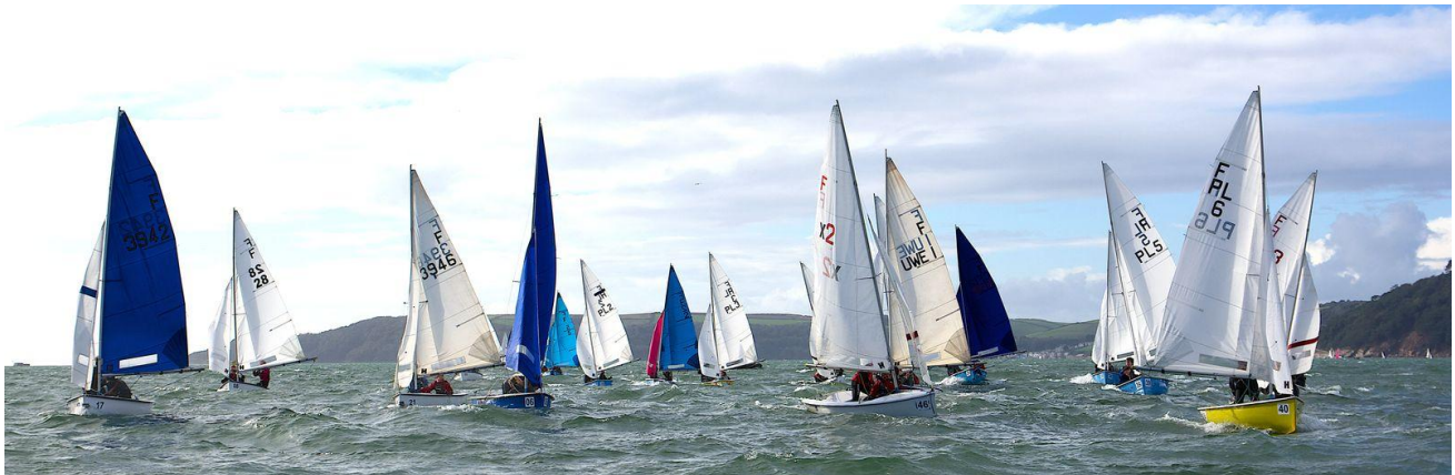
Fireflies racing at the 2014 Championship