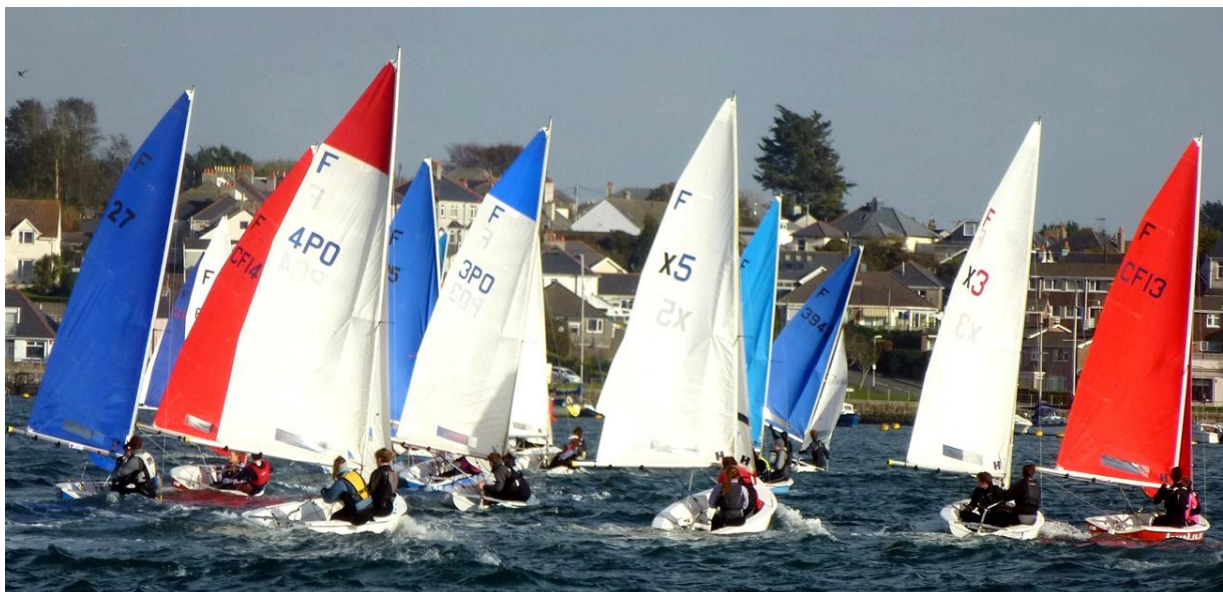
Some of the 52 Firefly dinghies on the 'run' in the Plymouth Cattewater

The award of the 2015 Championship to Cardiff follows a competitive process, with bids from three UK universities. Cardiff's proposal was submitted by Cardiff University Sailing Club, Cardiff University Students Union (CUSU) and Athletic Union, in partnership with Cardiff University and Cardiff Bay Yacht Club, supported by RYA Cymru Wales. Also collaborating with the other yacht clubs in Cardiff Bay, Cardiff City Council and other training centres, including Cardiff Bay Water Activity Centre, the University Sailing Club has the support and cooperation of the Cardiff Harbour Authority,