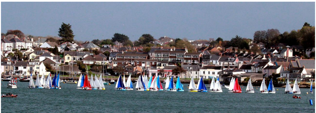
Fireflies line up for a start at the 2014 Championship