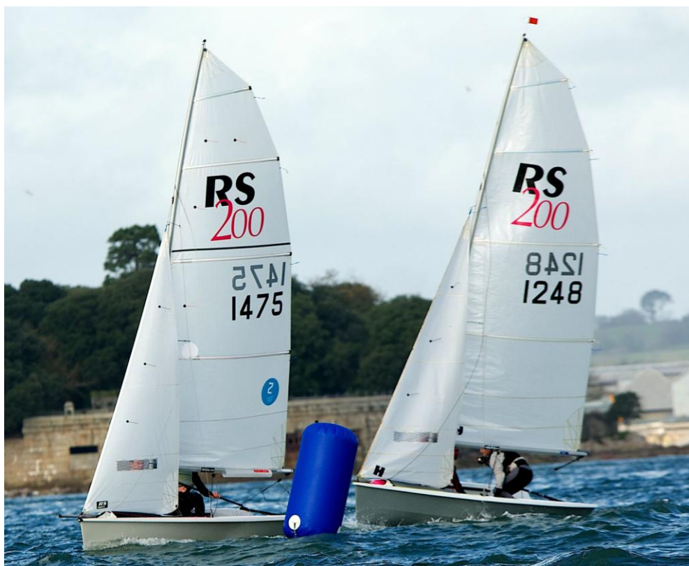
RS200s – among the popular classes in the Fast Handicap Fleet

Cardiff University hosts the annual Welsh Varsity, between Cardiff and Swansea, attracting 15,000 students to the Welsh Institute of Sport and the Millennium Stadium. This is the largest Varsity Event outside the Oxford and Cambridge Boat Race. And the Students' Union, having recently undergone refurbishment, is now a popular venue hosting big-name gigs and providing excellent social facilities, over and above the great nightlife of the City of Cardiff. Cardiff is a city of entertainment, culture and sport, drawing people in from all over the world all year round. A particular feature of Cardiff as a student sailing venue is the close proximity of the City Centre, University, Students' Union, and budget hotel accommodation to the Bay and land-base for the Championship at the Cardiff Bay Yacht Club.