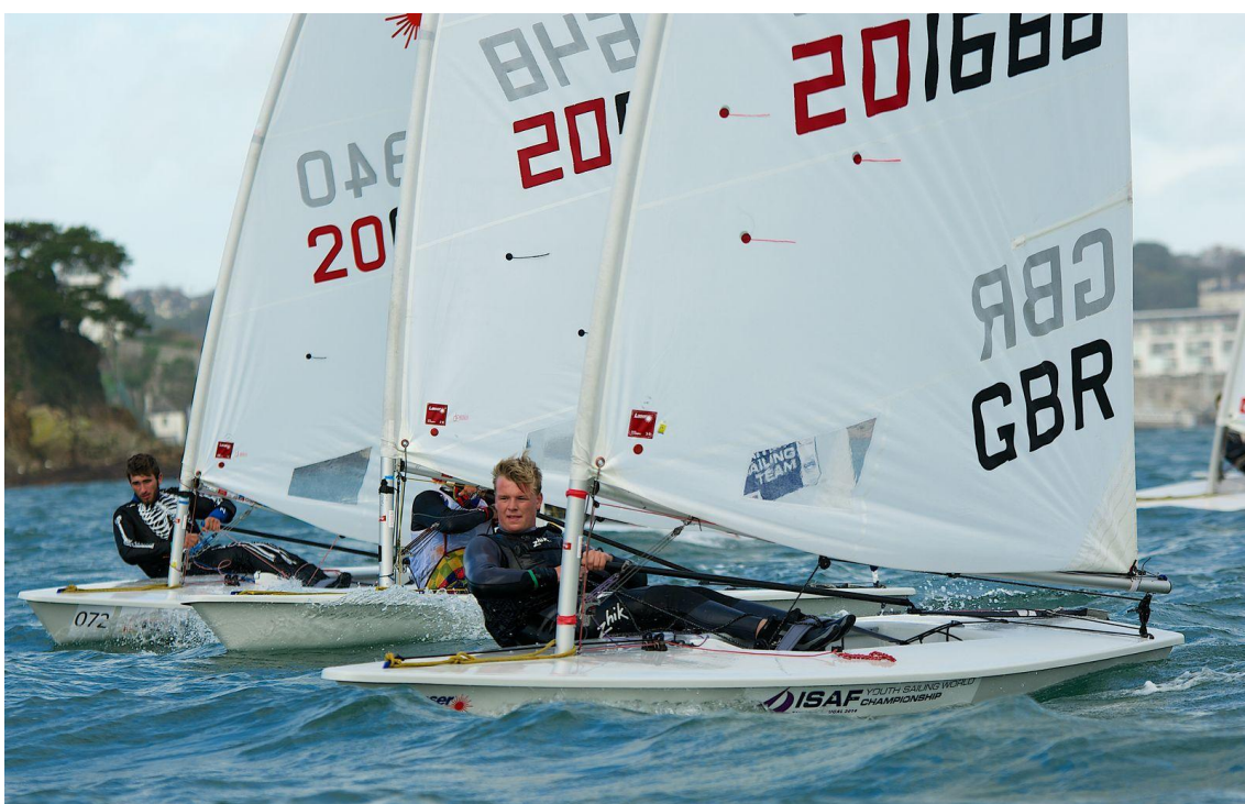
A battle to the line at the top of the Laser Fleet in 2014