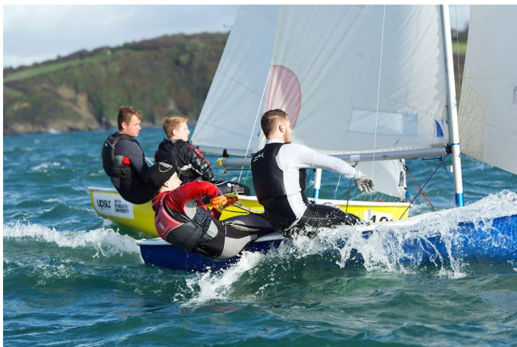
Close sailing in the Firefly Fleet

Cardiff University Sailing Club has a strong record in all aspects of student sailing. The only UK university approved in its own right as an RYA Training Centre, it has great facilities and capacity. Its more experienced sailors, many of them qualified instructors, play a key part in teaching students new to sailing and supporting recreational sailors in developing their skills, all of whom play a full part in the Club, both on and off the water. As well as having several teams competing in the annual BUCS Team Racing Championship, the Cardiff USC runs its own events, including the popular inter-university team racing fixture, the Welsh Dragon. Cardiff also competes in keelboats, regularly racing at the BUCS Yachting Championships on the Solent. In 2014, Cardiff represented Wales in the World Student Yachting Cup in La Rochelle in October 2014.