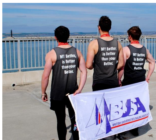
The Champions – all round view