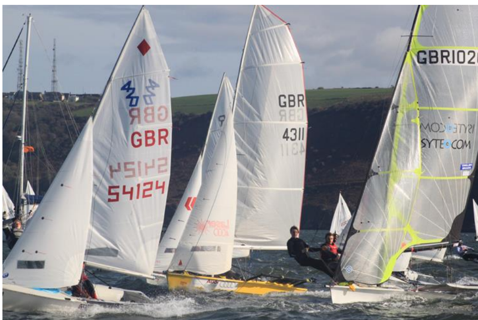
A Handicap start