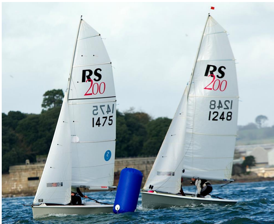
RS200s – among the popular classes in the Fast Handicap Fleet