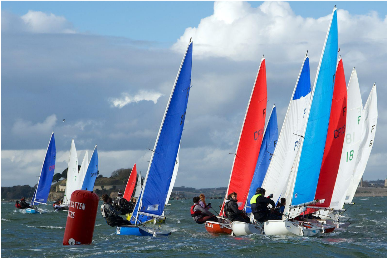
Fireflies at the 2014 Fleet Championships